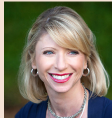
Amy Cuddy Social psychologist, author and lecturer