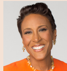
Robin Roberts Emmy award-winning journalist and author