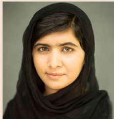
Malala Yousafzai (via pre-recorded interview) Activist for female education and gender equality